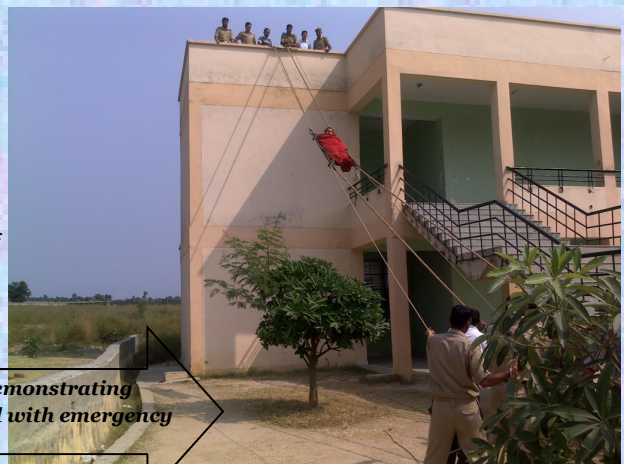
Students demonstrating how to deal with emergency

The civil defense team made the students aware various types of disasters and their management. They explained how a person can save lives of others while saving his/her own life during natural