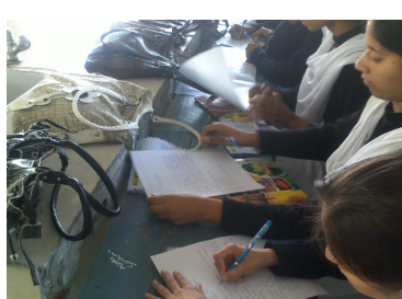
College Students Write for Rights on the eve of International Human Rights Day.