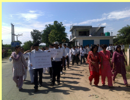
Peace March outside college campus