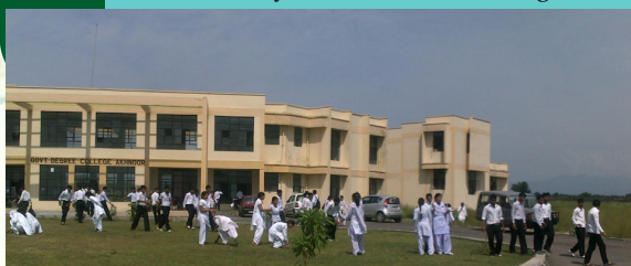
Students engaged in campus cleaning