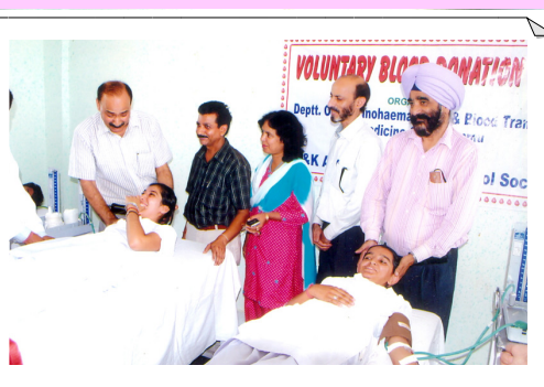
Students Donating Blood