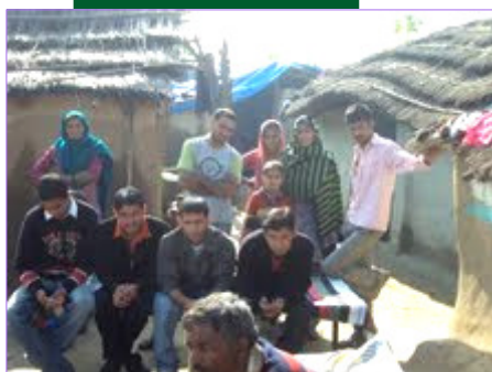
NSS Volunteers at service