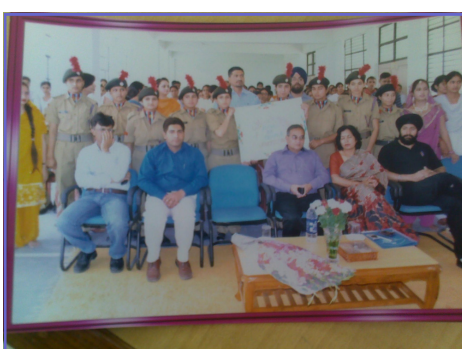
Anti-Drug/Female feticide program